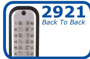
2921 Back To Back